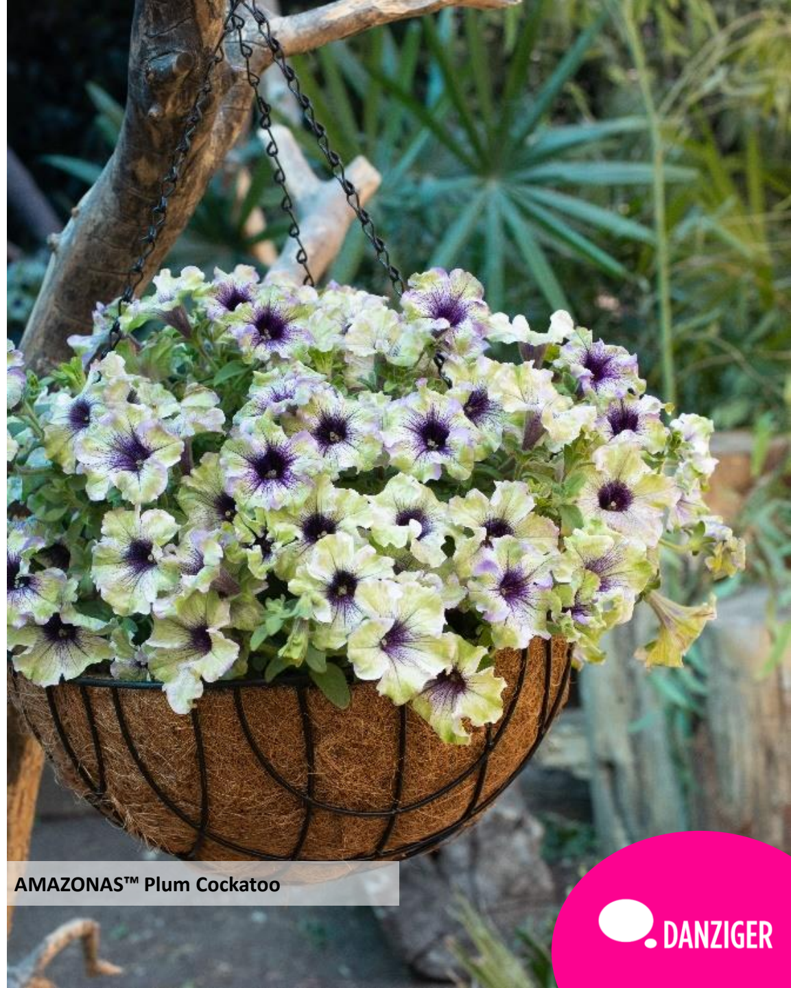
AMAZONAS™ Plum Cockatoo