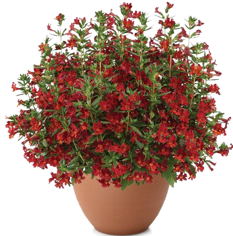
MAI TAI™ Red