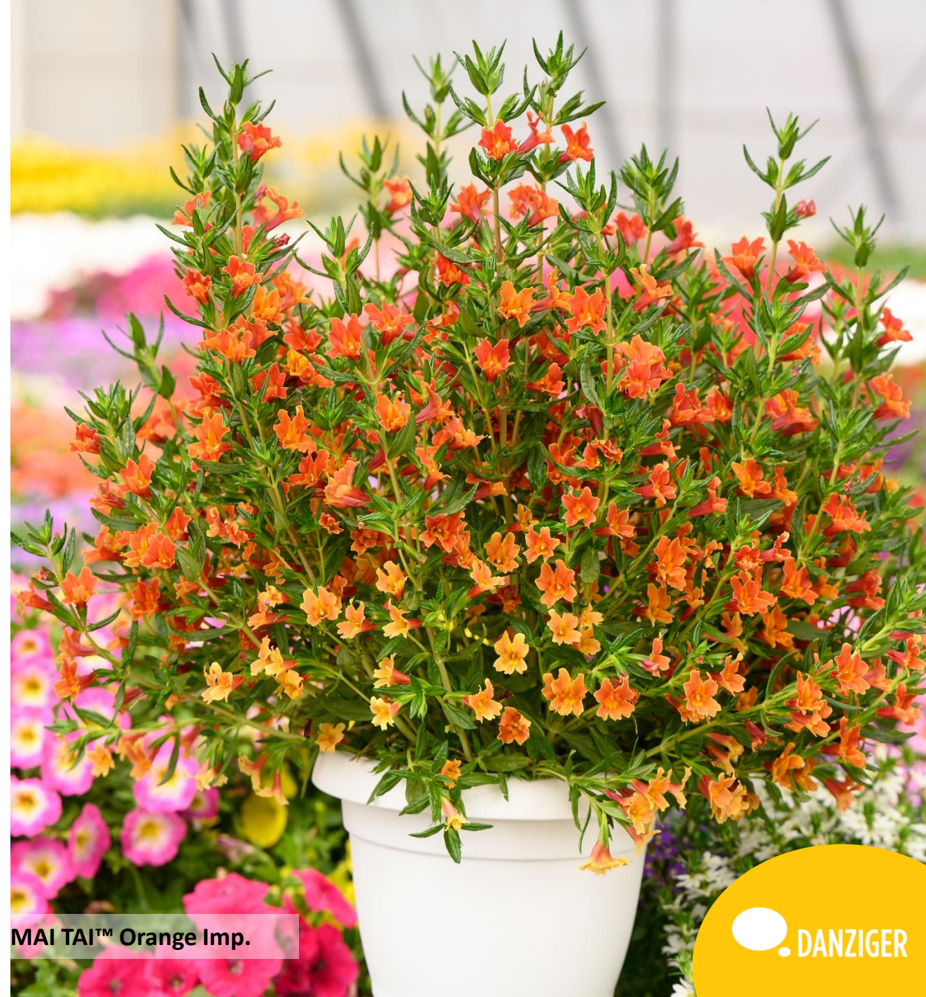
MAI TAI™ Orange Imp.