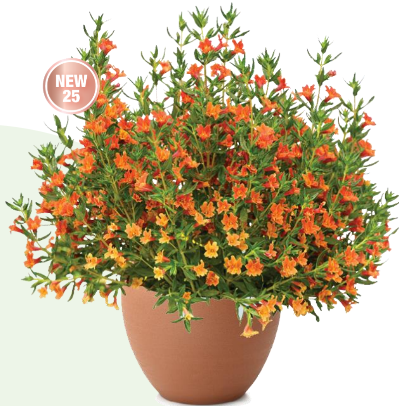
MAI TAI™ Orange Imp. MI-18-295