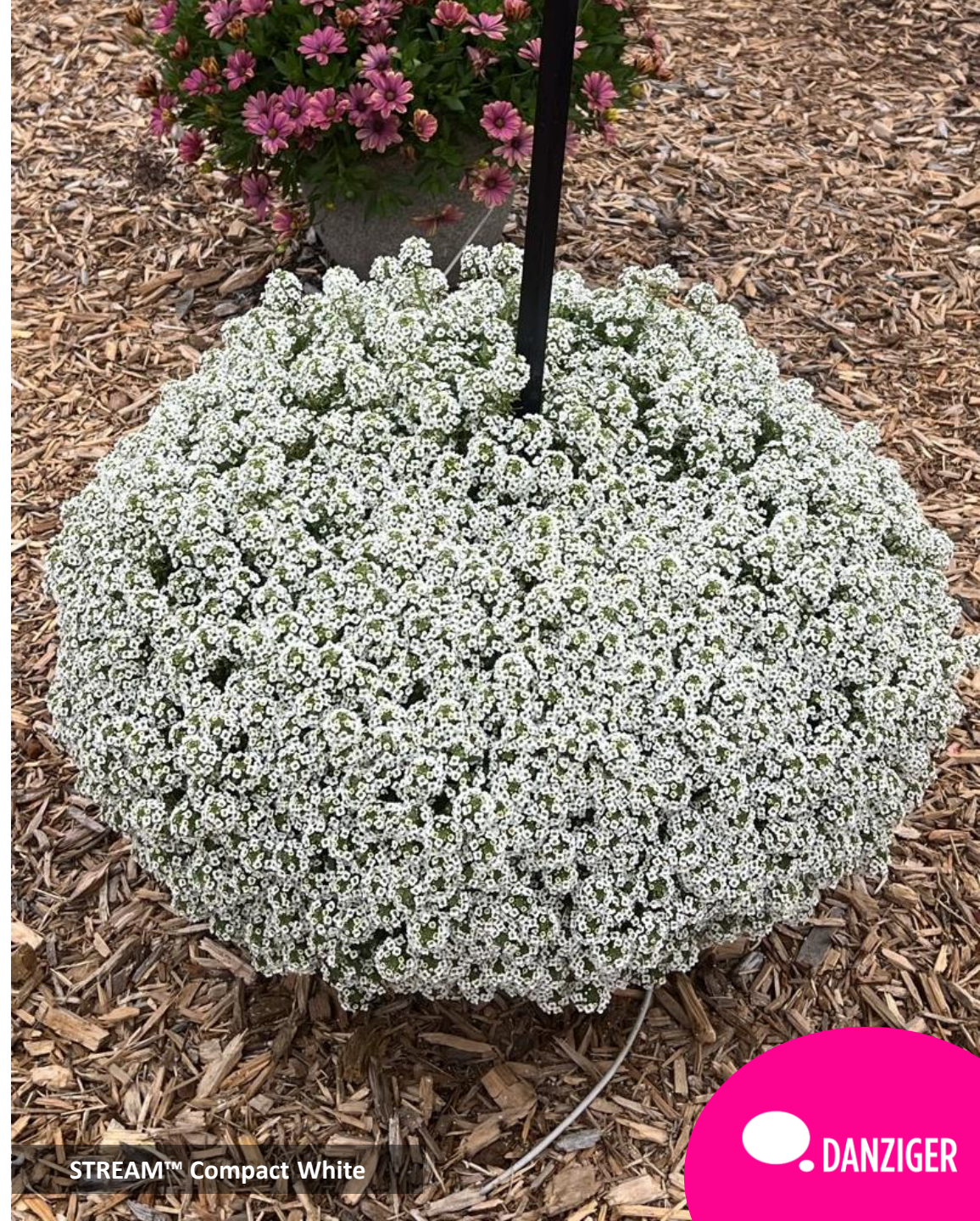
STREAM™ Compact White