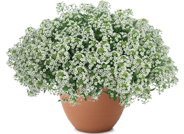
STREAM™ Compact White