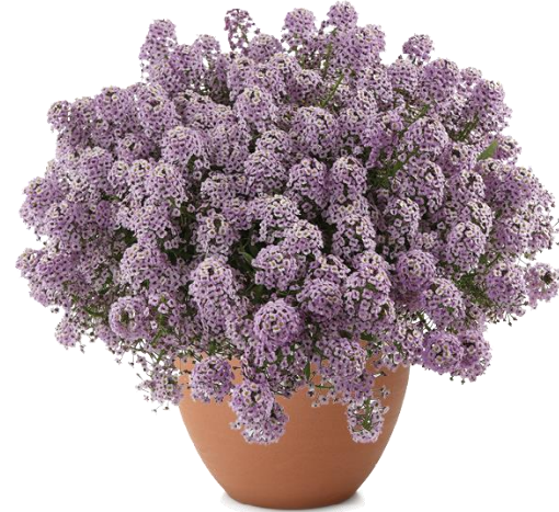
STREAM™ Compact Violet