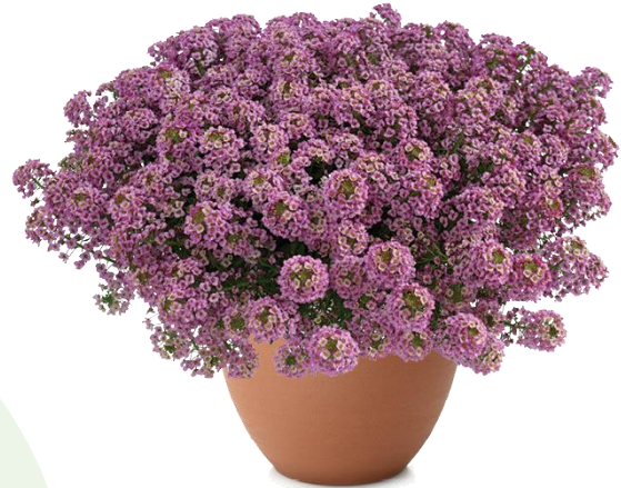
STREAM™ Compact Rose