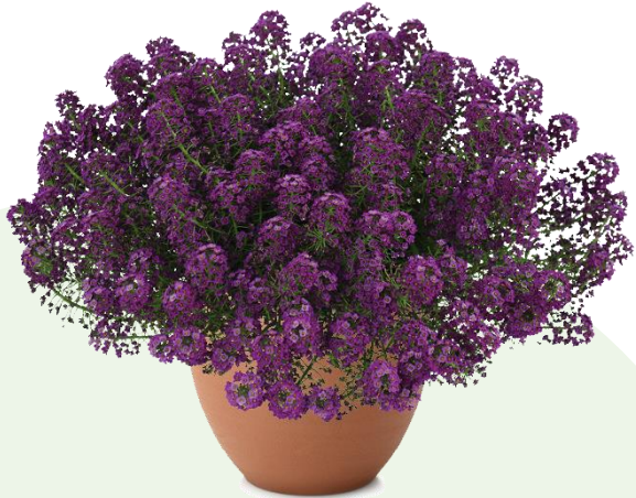
STREAM™ Compact Purple