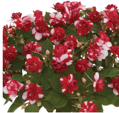
Musica® Bicolor Dark Red