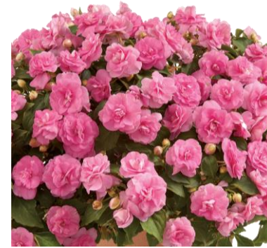
Musica® Pink Aroma