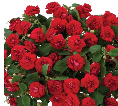
Musica® Elegant Red