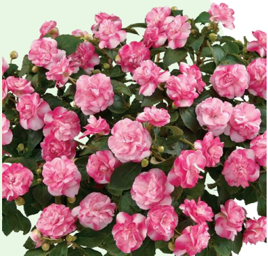
Musica® Bicolor Pink