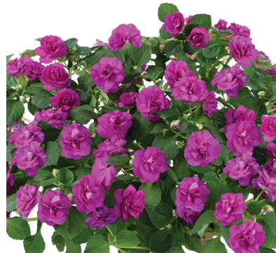
Musica® Electric Purple