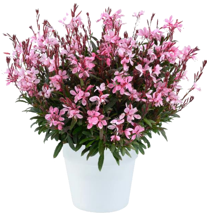
STEFFI™ Blush Pink Imp.