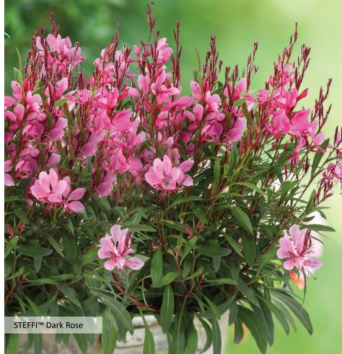
STEFFI™ Dark Rose