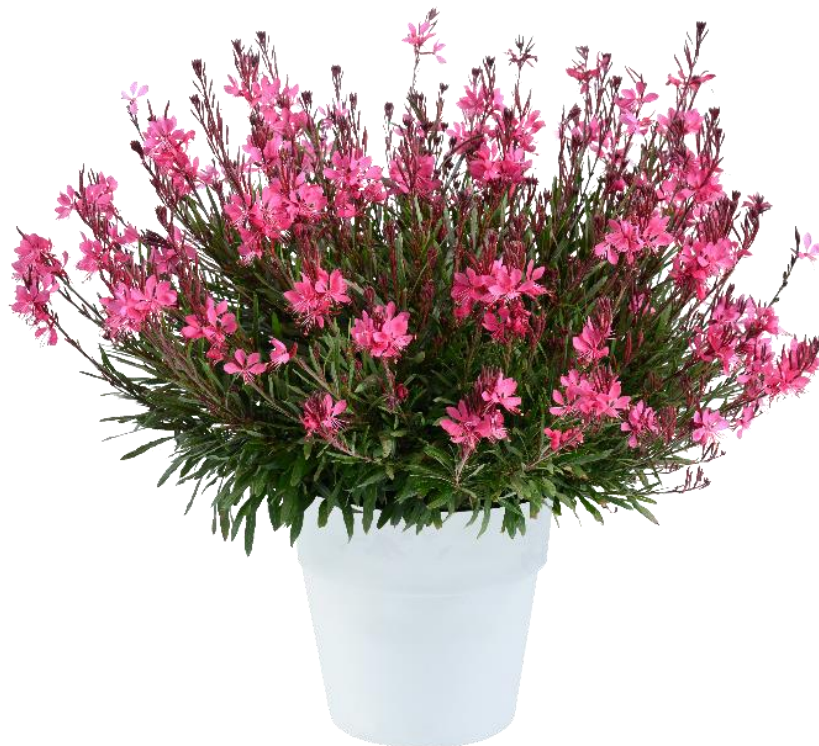
STEFFI™ Dark Rose Imp.