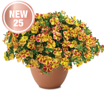
LIA™ Abstract Lemon Cherry