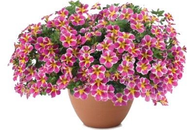
LIA™ Abstract Pink