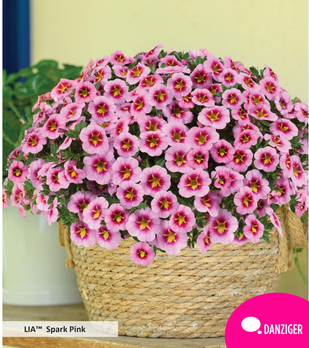
LIA™ Spark Pink