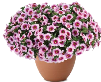
LIA™ Spark Pink