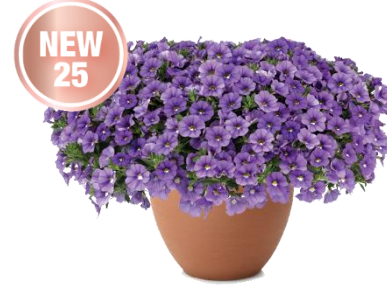
LIA™ Sky Blue