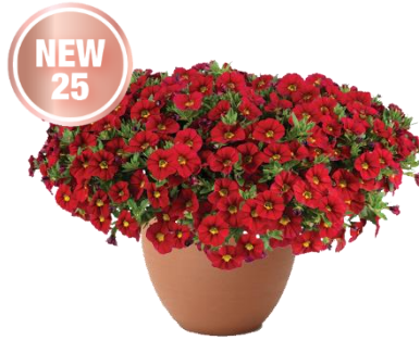
LIA™ Chili Pepper