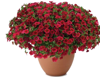
LIA™ Dark Red