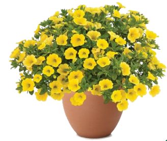
LIA™ Yellow Imp.