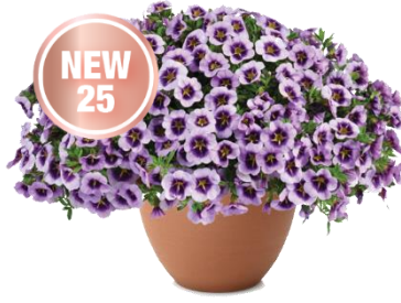
LIA™ Spark Lavender