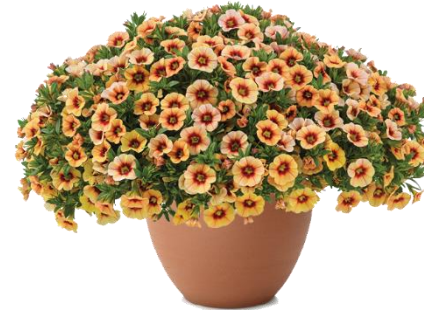
EYECONIC™ Com. Sunset