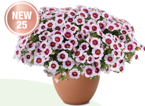
EYECONIC™ Cherry Blossom Imp.