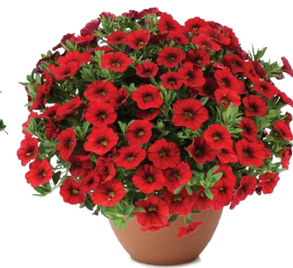
COLIBRI™ Bright Red