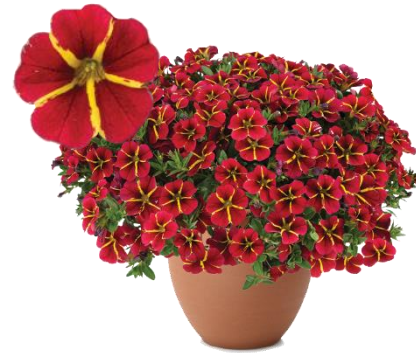
COLIBRI™ Exotic Red Bling