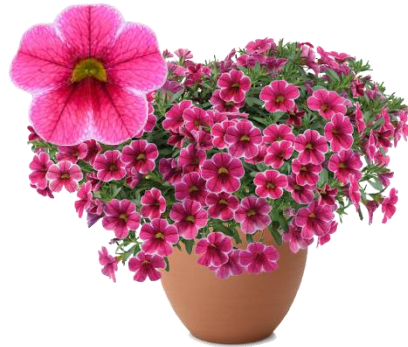
COLIBRI™ Cherry Lace