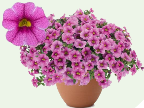
COLIBRI™ Pink Lace