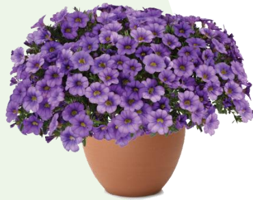
COLIBRI™ Dark Lavender