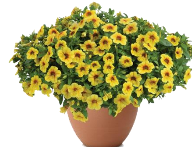
COLIBRI™ Mellow Yellow