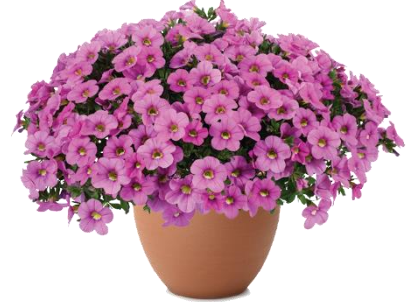
COLIBRI™ Pink Flamingo