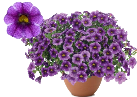
COLIBRI™ Purple Lace