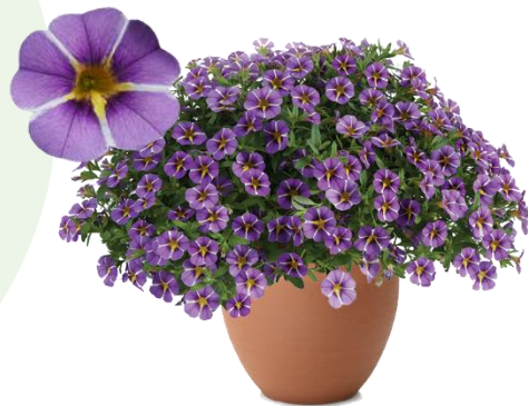
COLIBRI™ Purple Bling