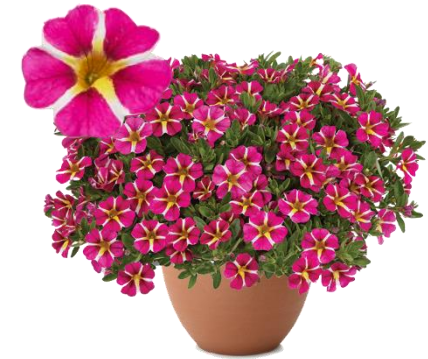
COLIBRI™ Pink Bling