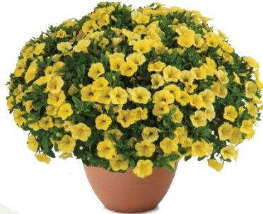
COLIBRI™ Yellow Canary