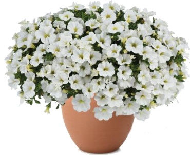
COLIBRI™ Pure White