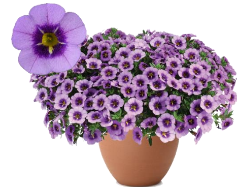
COLIBRI™ Spark Purple