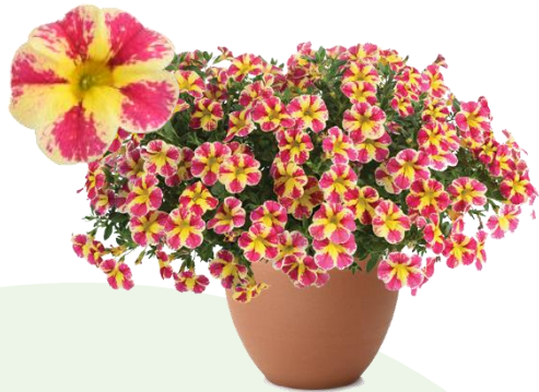
COLIBRI™ Abstract Guava