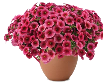
COLIBRI™ Malibu Pink