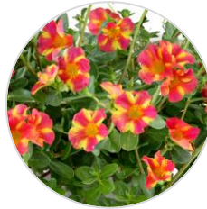
MEGA PAZZAZ™ Pink Twist