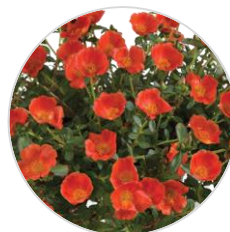
MEGA PAZZAZ™ Orange