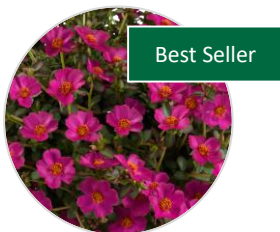
MEGA PAZZAZ™ Purple