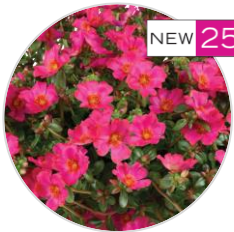
MEGA PAZZAZ™ Fuchsia