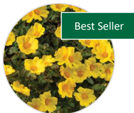
MEGA PAZZAZ™ Gold