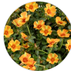
MEGA PAZZAZ™ Mango Twist