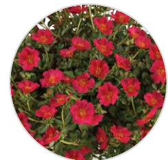
MEGA PAZZAZ™ Dark Pink

For additional technical growing information: