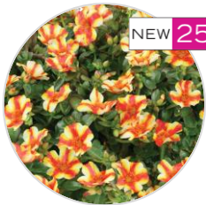
MEGA PAZZAZ™ Papaya Twist

More varieties in the MEGA PAZZAZ™ series: