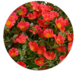
MEGA PAZZAZ™ Red