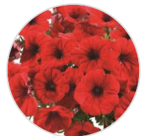
CASCADIAS™ Chili Red