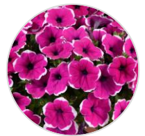
CASCADIAS™ Rim Cherry Imp.