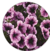
CASCADIAS™ Purple Ice