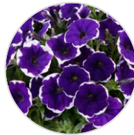
CASCADIAS™ Rim Violet Imp.