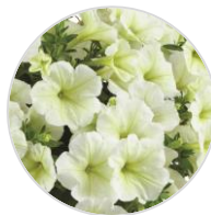
CASCADIAS™ Hint of Lime