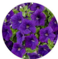
CASCADIAS™ Blue Omri