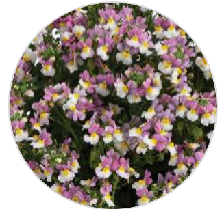
MENOR™ Dual Violet

For additional technical growing information: