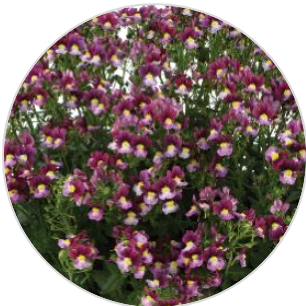
MENOR™ Dual Bordeaux