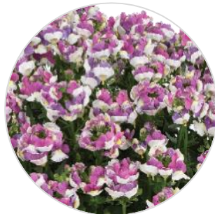
MENOR™ Dual Purple