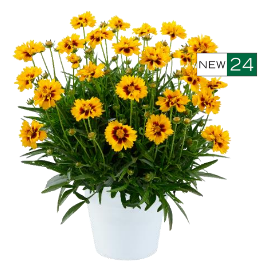
SOLANNA™ Sunset Bright

More varieties in the SOLANNA<sup>™</sup> series: