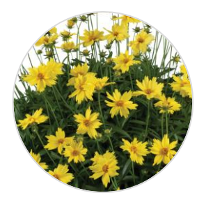
SOLANNA<sup>™</sup> Yellow Touch