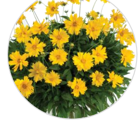
SOLANNA™ Sunshine Recommended for 15-18 /30-36 cm pots