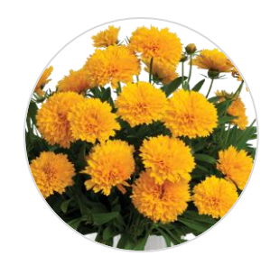
SOLANNA™ Golden Sphere Recommended for 12-18 cm pots