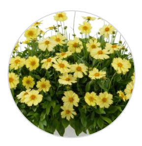
SOLANNA™ Glow Recommended for 15-18 /30-36 cm pots