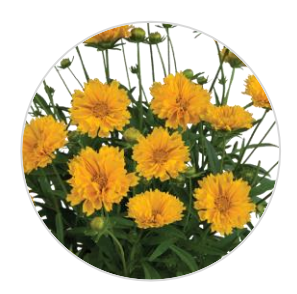
SOLANNA™ Golden Crown Recommended for 15-18 /30-36 cm pots