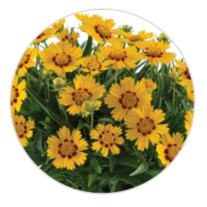
SOLANNA™ Bright Touch Recommended for 12-18 cm pots