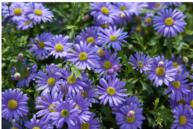
Flower trials 2022

For additional technical growing information: