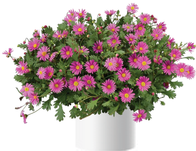
FRESCO™ Bright Pink