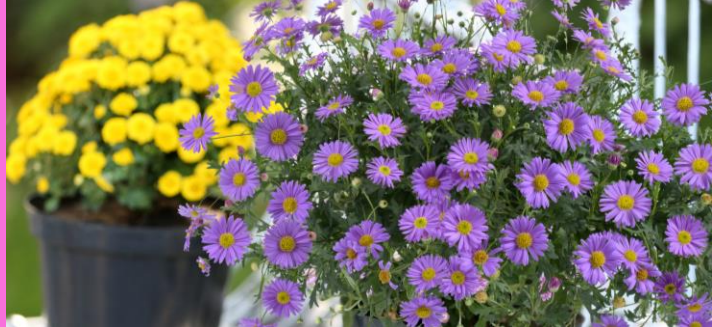
LVG Bad Zwischenahn, 2022