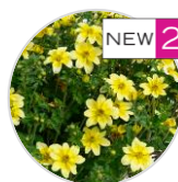
Yellow Splash Imp.™