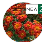
Blazing Ring of Fire™