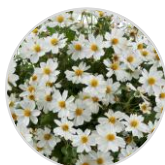
White Delight™ Imp.