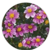
Pretty In Pink™ Imp.