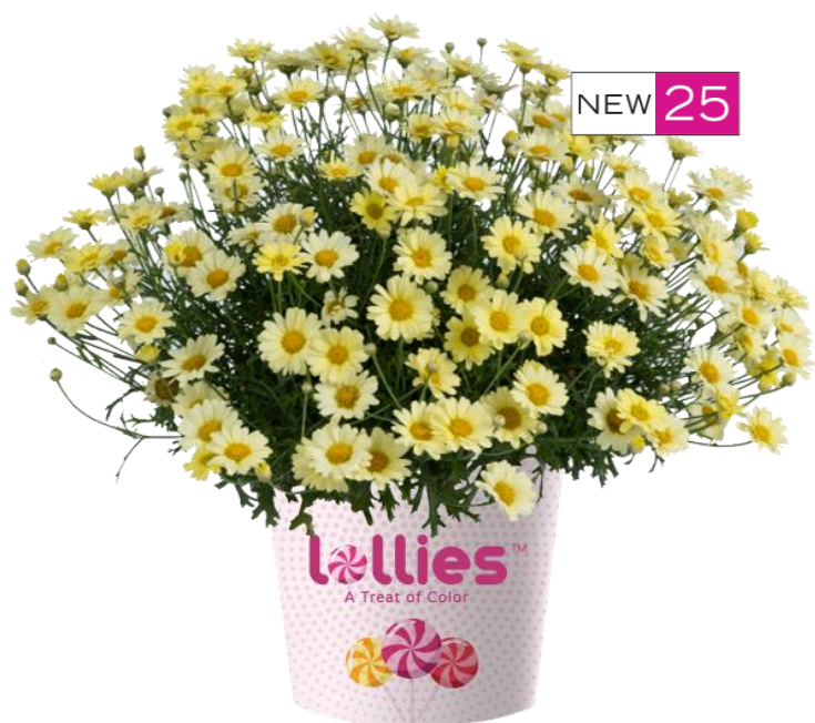
LOLLIES™ Buttermint Imp.