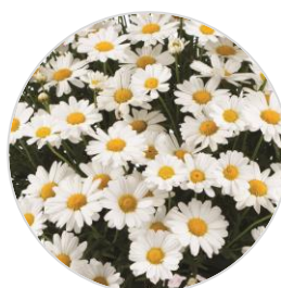
LOLLIES™ White Chocolate