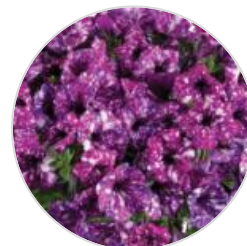
SPLASH DANCE™ Purple Polka

For additional technical growing information: