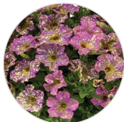
SPLASH DANCE™ Poppin' Pink