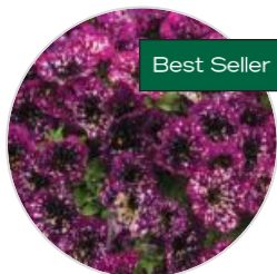
SPLASH DANCE™ Magenta Mambo