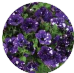
SPLASH DANCE™ Bolero Blue