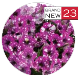
SPLASH DANCE™ Fuchsia Flamenco

More varieties in the SPLASH DANCE™ series: