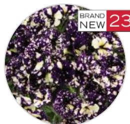
SPLASH DANCE™ Violet Vogue