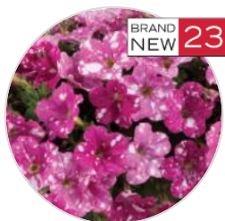
SPLASH DANCE™ Rumba Rose