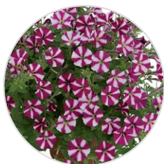
LITTLETONIA® Bicolor Illusion

More varieties in the LITTLETONIA® series: