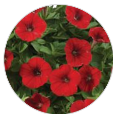
LITTLETONIA® Bright Red