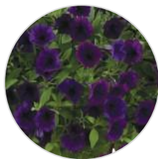
LITTLETONIA® Purple Blue