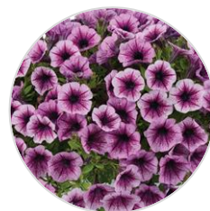
LITTLETONIA® Pink Splash