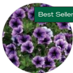
LITTLETONIA® Blue Vein