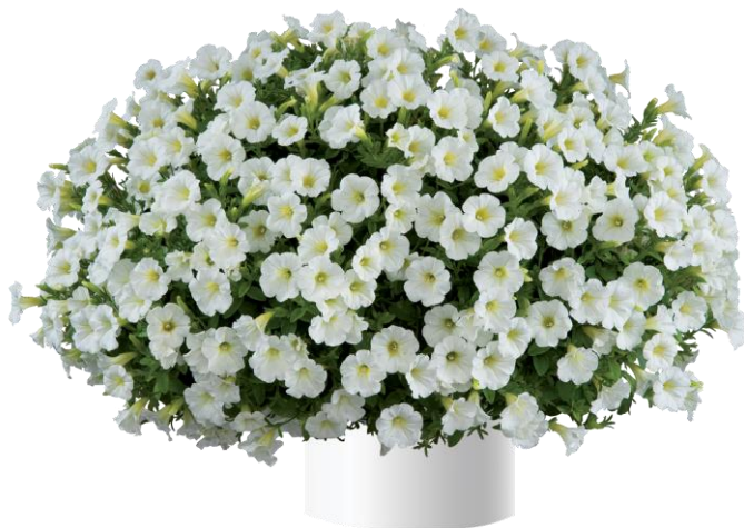
LITTLETONIA® White Grace