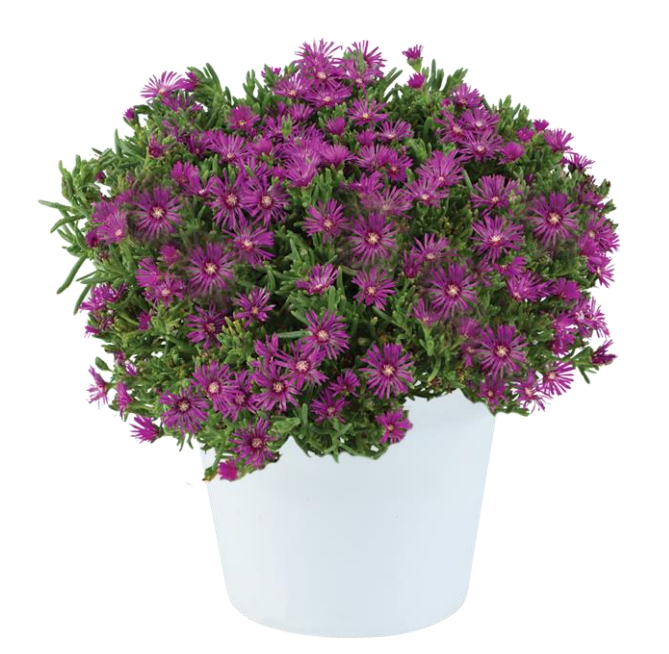
EARLY BIRD™ Purple