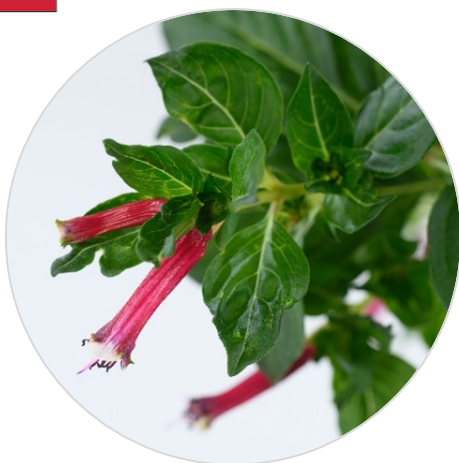
CUBANO™ Cristo | Cuphea hybrida