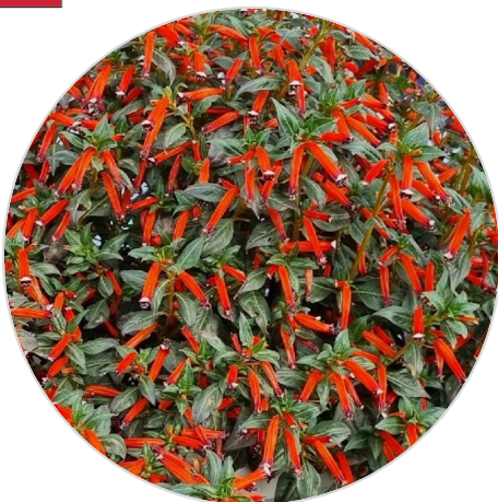
CUBANO™ Fuente | Cuphea ignea

For additional technical growing information: