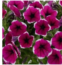
CASCADIAS™ Rim Cherry