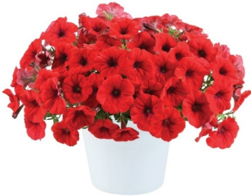
CASCADIAS™ Chili Red