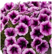
CASCADIAS™ Purple Ice