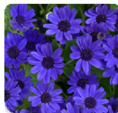
Primavera™ Navy Blue

For additional technical growing information: