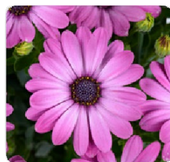
Ostica™ Mega Pink