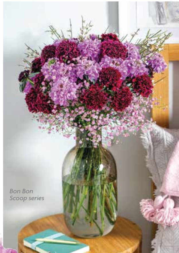
Bon Bon Scoop series

Today the global cut flower industry wants rich textures, multi-petals, extra layers, intense colours and ‘full appearance’ flowers, so to answer this need, Danziger introduced the Scoop™ Scabiosa series. Breeders used new technology to reinvent this cottage-garden favourite and the Scoop series of strong-stemmed Scabiosa in a range of colours and bicolours is taking the flower world by storm. There are four Scoop series on offer.