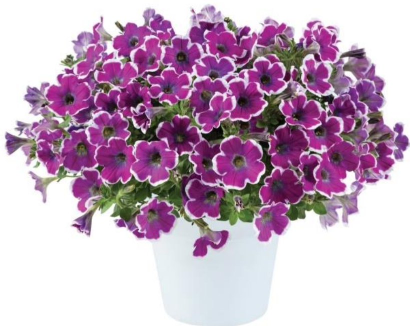
HIPPY CHICK™ Violet